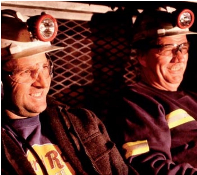
West Wallsend Colliery employees on their way to start a new shift.

Further mine planning is being undertaken in conjunction with environmental studies to ensure that impacts are minimised and best practice management measures will continue to be implemented.