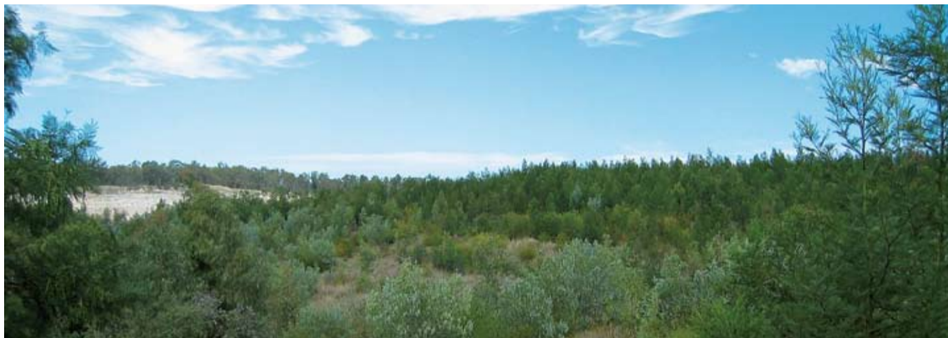
Rehabilitation at Westside Mine.

Some of the species used in rehabilitation at Westside Mine include Spotted Gum ( Corymbia maculata ), White Stringybark ( Eucalyptus globoidea ) and Black She-Oak ( Allocasuarina littoralis ). Despite the very dry weather that was experienced during summer, the native plant species that were planted have survived and are growing well.