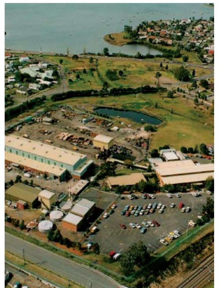
Teralba Colliery Southgate site.

Further details on specific activities and progress of the rationalisation processes will be provided to local residents and in subsequent editions of this newsletter.