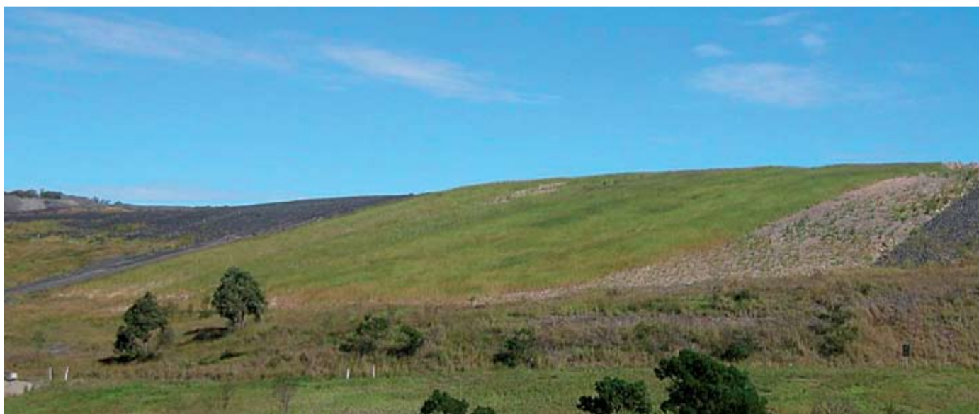
Rehabilitation and temporary grass cover on the MCPP Reject Emplacement Area.

Once the revegetation program is finalised, MCPP is planning to progressively rehabilitate areas which have been shaped to a final landform.