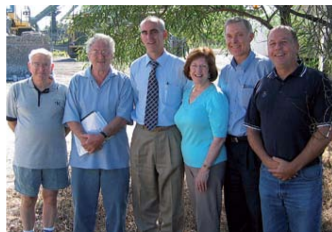
Westside Mine CCC Members.